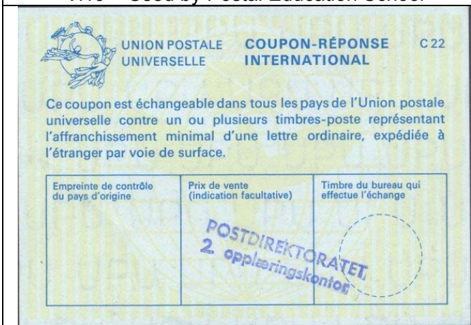
La24 - Used by Postal Education School