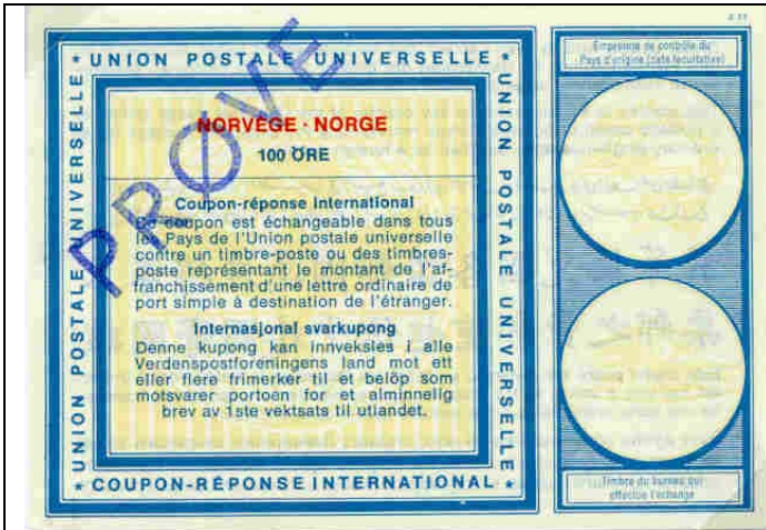
Vi19 – Used by Postal Education School